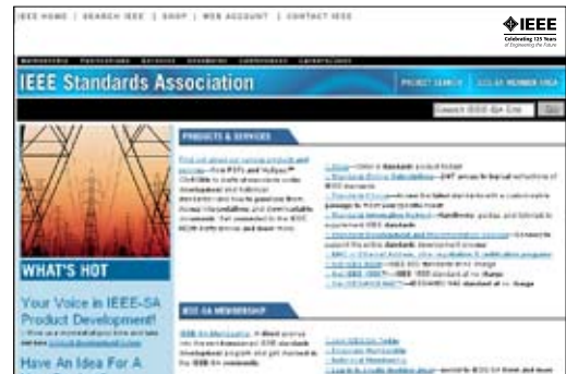
Black IEEE 125th Anniversary Mark on IEEE sub site