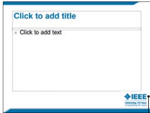
Blue IEEE 125th Anniversary Mark on PowerPoint presentation. Rules on clear space, minimum size, and placement are followed.