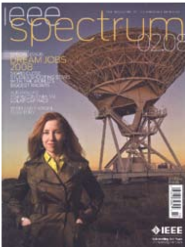
White and black IEEE 125th Anniversary Mark on printed collateral. Rules on clear space, minimum size, and placement are followed.

Using the IEEE 125th Anniversary Mark correctly and consistently is essential to maintaining our brand equity. As outlined in the previous pages, consideration must be given to clear space and minimum size. On print applications and PowerPoint presentations, place the IEEE 125th Anniversary Mark on the first page in the bottom right-hand corner. Within the headers of IEEE sub sites, the IEEE 125th Anniversary Mark should be placed in the upper right-hand corner.