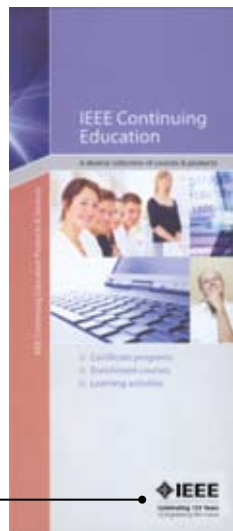
White and black IEEE 125th Anniversary Mark on printed collateral. Rules on clear space, minimum size, and placement are followed.